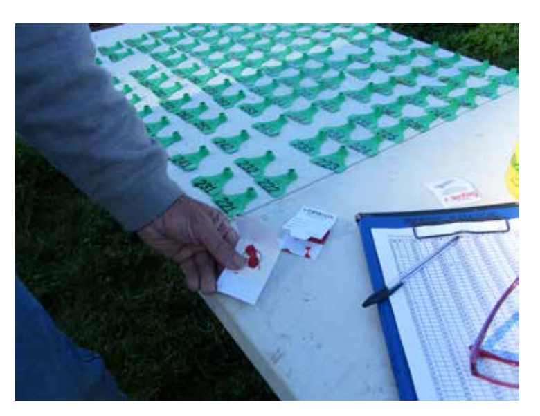
Figure 2. Blood cards being used at lamb marking.

• It can be used to determine sire pedigree in syndicate matings.