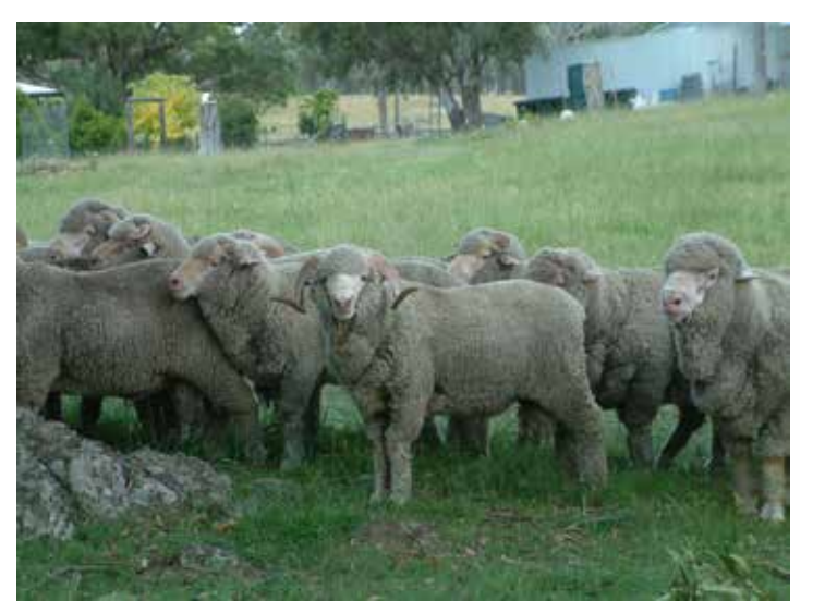
Figure 1. Variety of horn phenotypes.