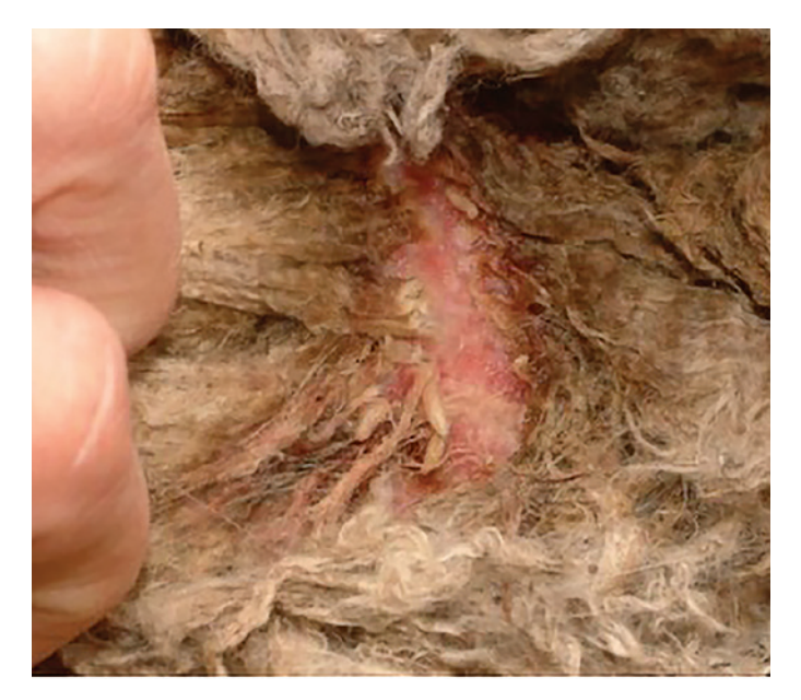
Covert flystrike can be difficult to detect unless handling sheep

Covert flystrike can last for some weeks before advancing into more obvious flystrike during warm, moist conditions or they can resolve without the need for treatment.