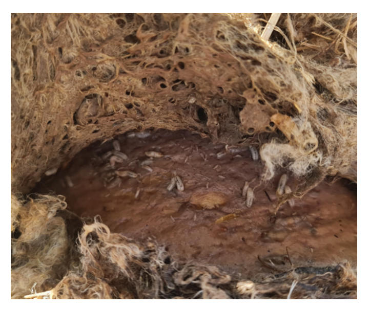
Example of advanced strike

When monitoring for flystrike, the aim is to detect strike as early as possible to minimise pain and suffering.