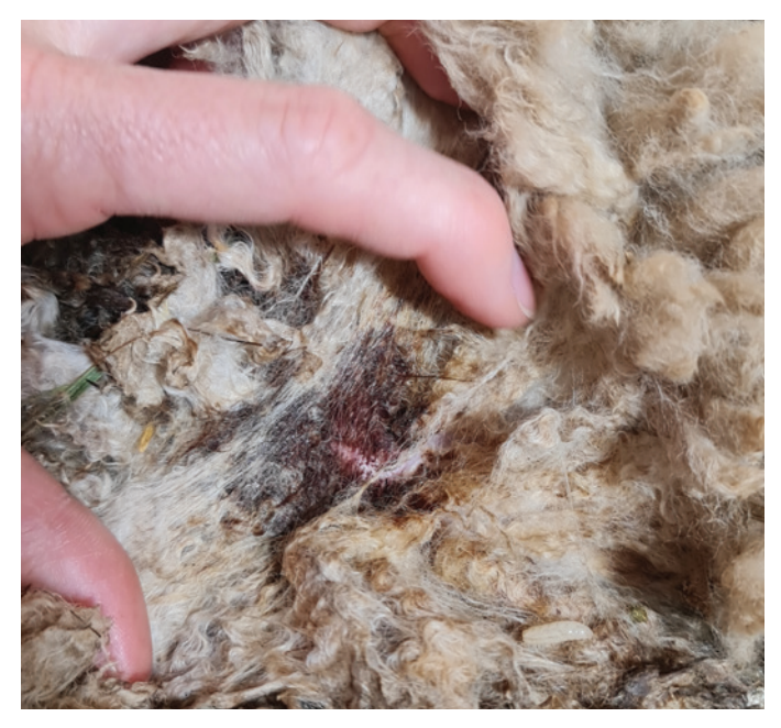
Example of early detectable strike

Identifying why the strike occurred will help you work out whether it is an anomaly (only one sheep is affected), in which case dramatic intervention may not be warranted, or if it is an indicator that an outbreak is imminent. Consider if the strike occurred due to a management error (e.g. poor or delayed crutching, chemical application error, failure to implement preventative action soon enough in a normal season) or due to the susceptibility of your sheep.