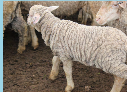
An example of body wrinkle in lambs.