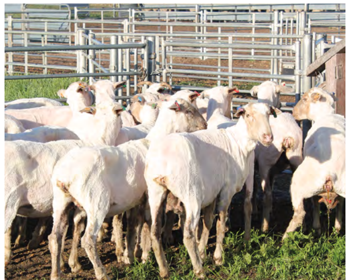
Shearing sheep reduces wool length so flystrike prone areas dry quickly.

Shearing and crutching can provide up to six weeks protection from body and breech flystrike. If sheep are scouring, this protection may be reduced to three weeks.