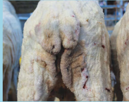
An example of extreme breech wrinkle and stain.