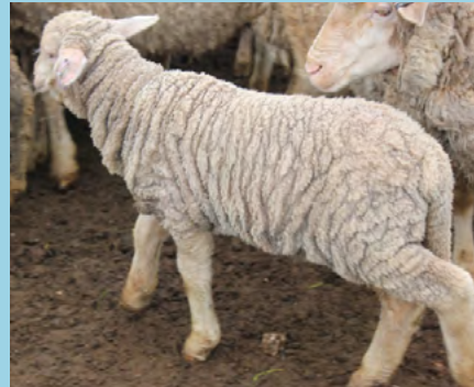
An example of body wrinkle in a lamb.