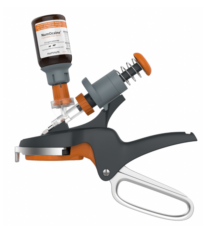
Numnuts <sup>®</sup> device for administering NumOcaine <sup>®</sup> during ring castaration and tail docking.

Tri-Solfen<sup>®</sup> needs to be sprayed onto open wounds to work and DOES NOT provide pain relief for rings.