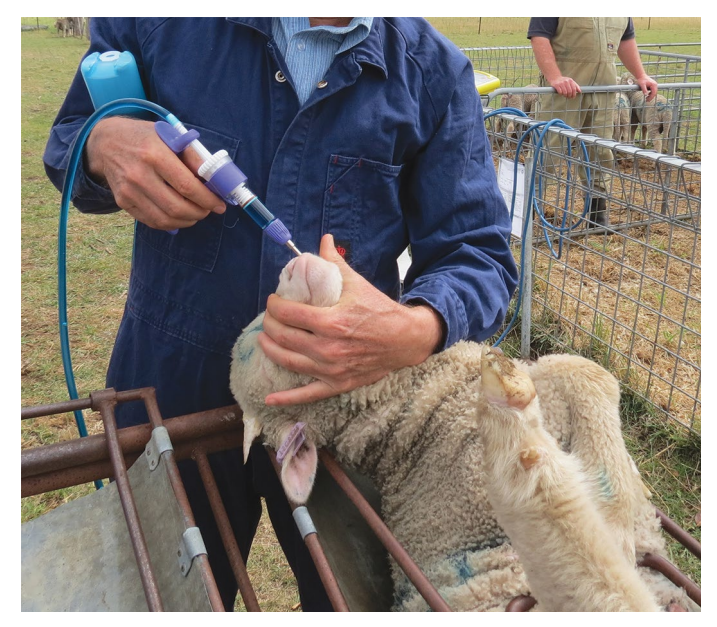
Products like Buccalgesic® administer the dose of meloxicam orally as a viscous paste, inside the mouth between the gums and cheek, with no needle required.

Meloxicam , a non-steroidal anti-inflammatory drug (NSAID), is registered for use as both an injectable product and for oral application.