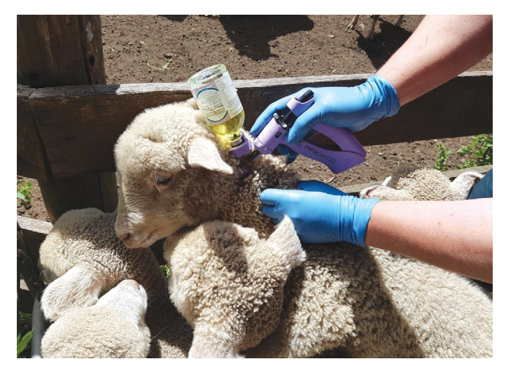
Products like Metacam® 20 administer meloxicam as a subcutaneous injection high on the neck behind the ear.

Products with meloxicam alleviate pain and reduce inflammation, fever and fluid production caused by tissue damage. These analgesic products are slower-acting than local anaesthetics but provide longer-lasting pain relief. When it comes to lamb marking these products can be used for mulesing, surgical castration, hot or cold knife tail docking, and castration and tail docking with rings.