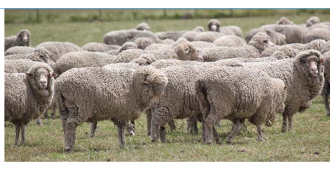
MerinoLink's MLP F1 ewes pre-shearing, October 2021.

At weaning in September which followed a wet, cold winter with a high worm burden, 103% lambs were weaned to ewes joined. The 2016 drop ewes averaged 60.8kg and CS 2.3, while the 2017 drop averaged 62.1kg and CS 2.5. The change of season saw a massive pasture growth with a corresponding production improvement. Classing and midsides were undertaken in mid-October. December pre-joining assessments saw the 2016 drop ewes sitting at 67.4kg and CS 3.3, the 2017 drop ewes averaging 68kg and CS 3.4.