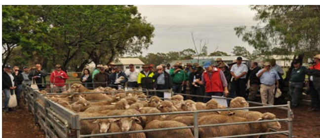
Penside sire introductions at Macquarie's MLP field day, March 2020

Download field day results at: merinosuperiorsires.com.au/mlp-project-reports