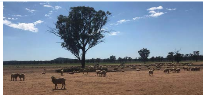
MerinoLink 2016 drop ewes, early March 2020.

A rainfall of 120mm in the first few months of 2020 saw the ewes move out of confinement feeding in mid-March. The ewes were pregnancy scanned on March 17 where both drops averaged condition score 2.8. The 2016 drop ewes scanned 148% foetuses with 95% of ewes in lamb and the 2017 drop scanned 127% foetuses with 86% of ewes in lamb. These are solid results for the site following difficult seasonal conditions.