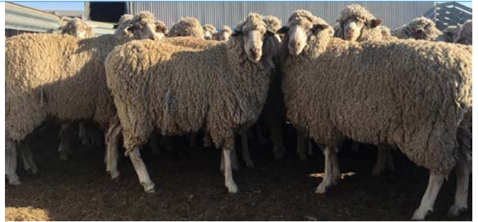
Pingelly's 2016 drop ewes on their way into the shearing shed, December 2019.

A dry summer has seen supplementary feeding of the Pingelly ewes carried out over an extensive period. Ewes were joined in February with the 2016 drop averaging condition score 3.0 and the 2017 drop 2.7. A recent monitor has seen the 2016 drop move up to 3.1 with the 2017 drop also lifting to 2.9. Pregnancy scanning of both drops is scheduled for April.