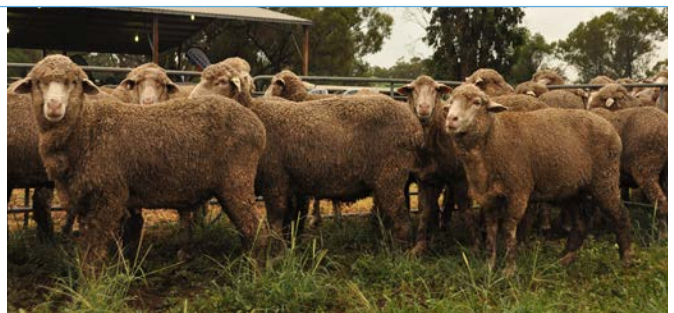
Macquarie 2018 drop ewes in the rain at the field day, March 2020

With 180mm of rain received already in 2020 the Macquarie ewes will move to some green feed during lambing after years of drought feeding. Pregnancy scanning took place in February with both drops averaging a condition score of 3.1. The 2018 drop maiden ewes scanned 111% foetuses with 95% of ewes in lamb and the 2017 drop scanned 134% foetuses and 94% of ewes in lamb. This is a great conception result for the site, especially considering the recent dry conditions. As reported, a successful field day was held on March 4.