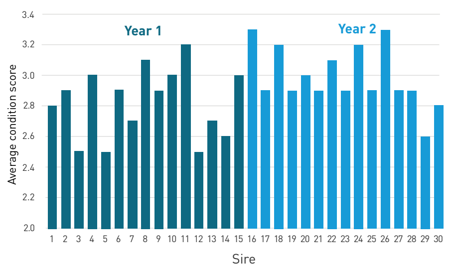
Figure 1. The average condition score of 3-year-old wether progeny from 15 different sires in year 1 (2016 drop) and 15 sires in year 2 (2017 drop). The progeny from each drop had grazed together since birth and their condition score was measured at the start of the experiment at the end of summer/early autumn.