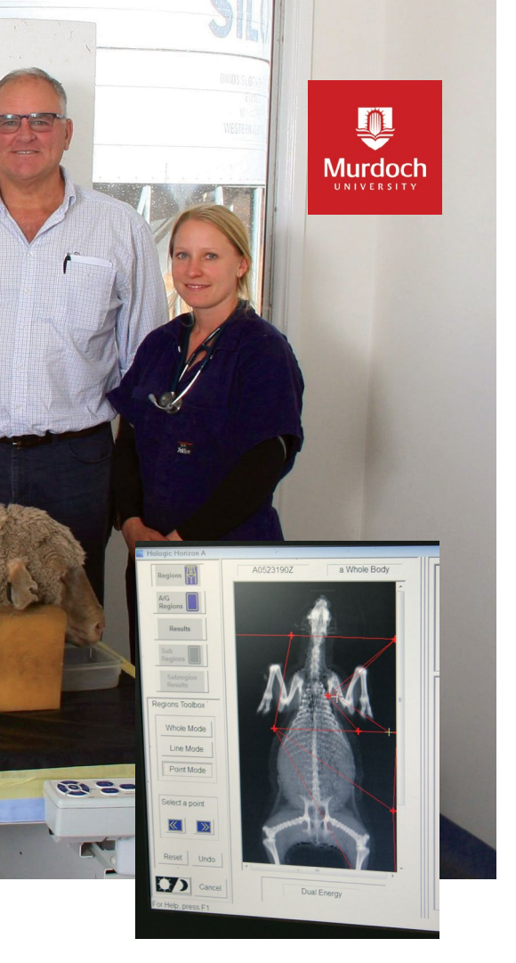
DEXA image of a wether for the assessment of the carcass components of fat and lean tissue.

genotypes of the same weight. We have seen in the MLP trial that some sire groups end up in considerably higher condition scores under the same conditions suggesting some fundamental differences between progeny groups.