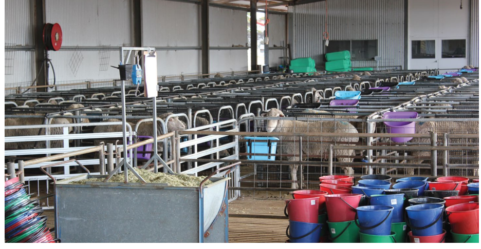
Wethers for the individual pen trial component of the project at the DPIRD WA Katanning Research Facility.

The feed intake results from the work have also been fascinating. There are big differences between sire groups in how much the sheep ate when given unlimited opportunity (ad libitum feeding). The differences between sire groups were as much as 0.5kg per day or around 25% different (see Figure 2 on previous