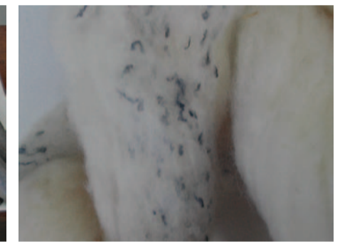
Remnants of Jumper