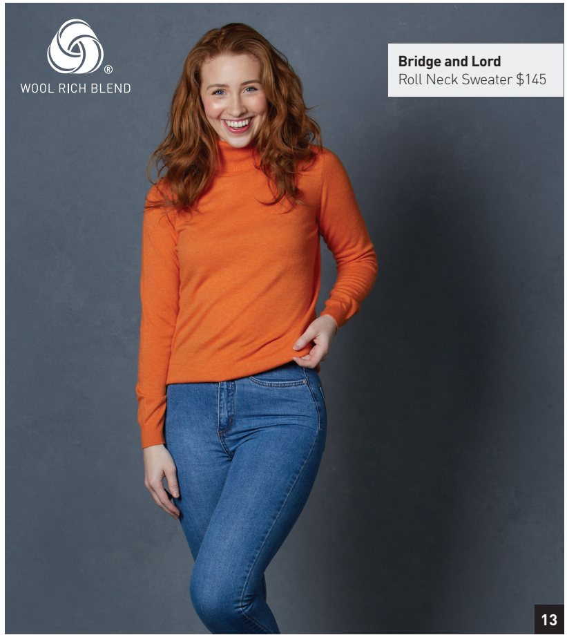
Bridge and Lord Roll Neck Sweater $145