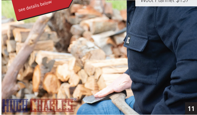
Hugh Charles Wool Flannel $159