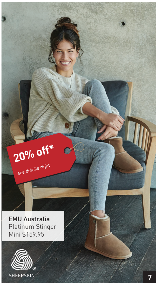
EMU Australia Platinum Stinger Mini $159.95