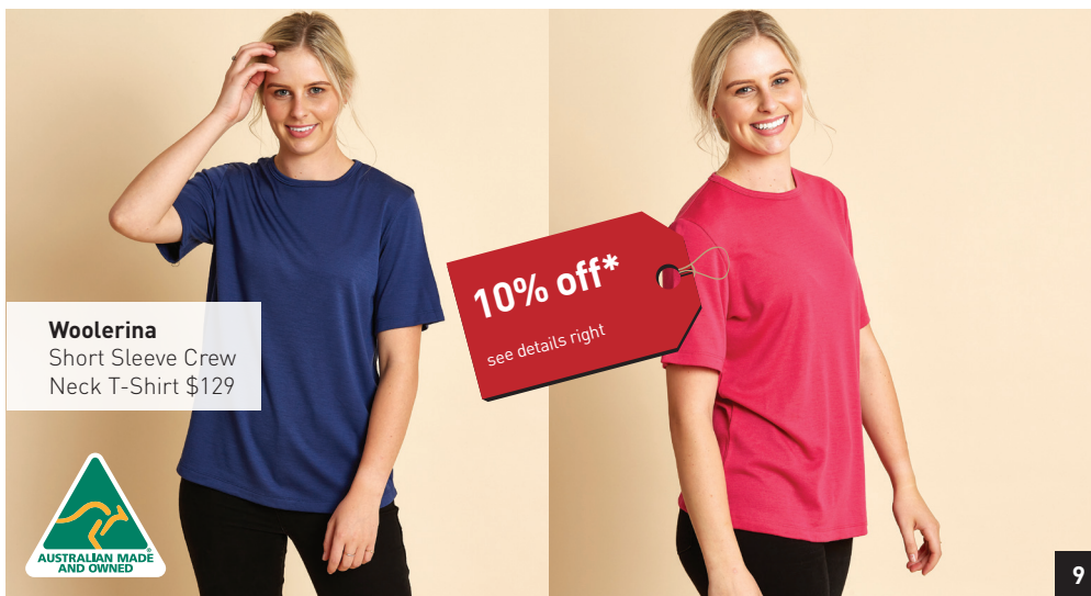
Woolerina Short Sleeve Crew Neck T-Shirt $129

* Discount applies storewide, discount Code – BTBSPRING20 Expires 31st December 2020