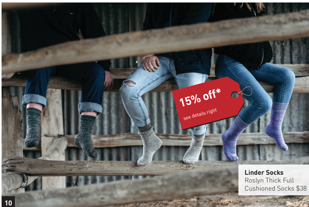
Linder Socks Roslyn Thick Full Cushioned Socks $38