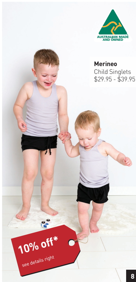
Merineo Child Singlets $29.95 - $39.95