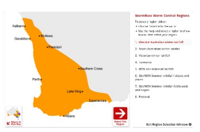
A WormBoss worm control program is available for the Western Australian winter rainfall region.