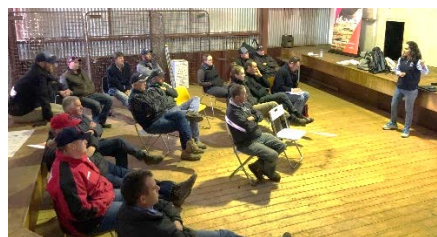
An AWI 'Smart tags and future of wool production' workshop at Willera Merinos in Serpentine , north-west Victoria.