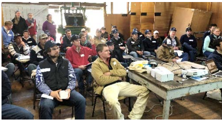
Students from Marcus Oldham college on a RAMping Up Repro workshop held in June at Lal Lal Estate near Ballarat .