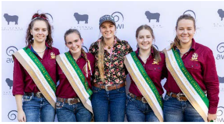
Melbourne's winning Flinders Christian Community College team at the 2019 National Merino Challenge.