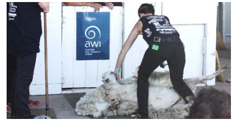
AWI-sponsored shearing and wool handling competition at the Natimuk Show in western Victoria.