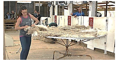
The AWI-supported wool handling competition at the Yallunda Flat Show on the Eyre Peninsula.