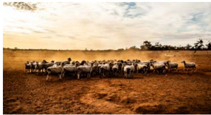
AWI provides a range of drought planning and management resources for SA woolgrowers experiencing drought.