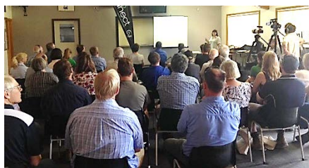
75 producers at a Sheep Technology workshop at Naracoorte in February.