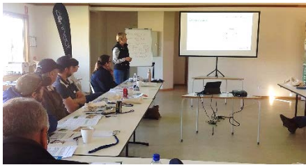
A Winning with Weaners workshop held in July at Truro , one of several workshops delivered in South Australia.