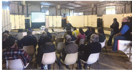
A RAMping Up Repro workshop held at Frankland in the Great Southern Region of WA.