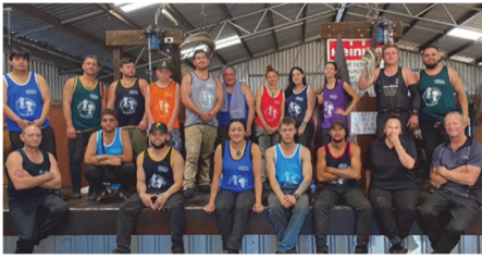
AWI-sponsored shearing and wool handling course at Boyup Brook in the south west of WA.