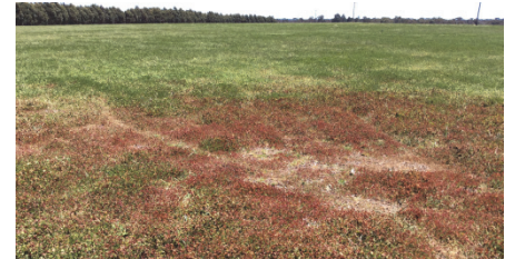
AWI and its partners responded quickly to outbreaks of subterranean clover Red Leaf syndrome in WA.