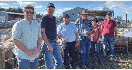
Stud breeders gathered at a Merino Lifetime Productivity field day at the Pingelly site.