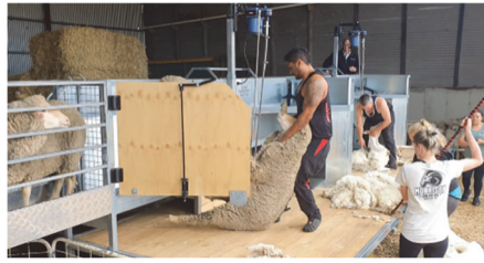
The AWI modular sheep delivery unit on display at the AWI Wool Harvesting Innovation Day at Gairdner .