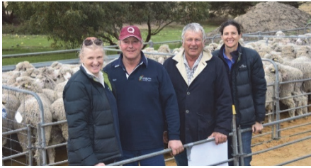
Sire Evaluation in South Australia is currently based at the Eckert family's 'Mentara Park' property at Malinong .