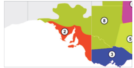
WormBoss worm control programs are available for the South Australian winter rainfall region and pastoral region.