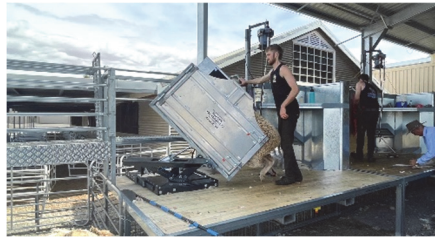
The AWI modular sheep delivery unit on display at an AWI Shearing Innovation Day at Jamestown in SA.