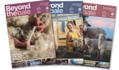
Beyond the Bale , AWI's quarterly magazine for wool levy payers, is available to woolgrowers across South Australia .

SA woolgrowers can keep up to date via regular communications from AWI: