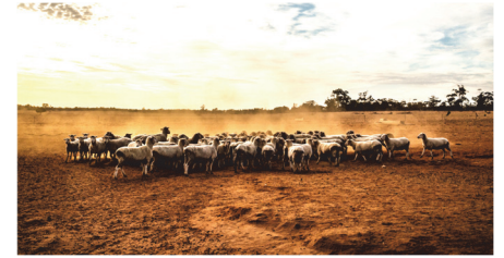
AWI provides a range of drought planning and management resources for South Australian woolgrowers.