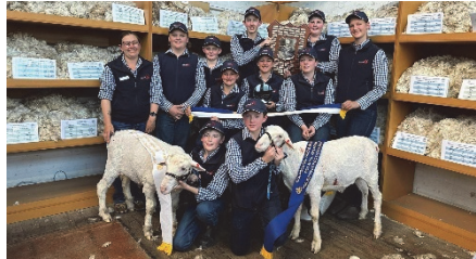
Unity College from Murray Bridge was the winner of the 2023 School Merino Wether Competition in South Australia.