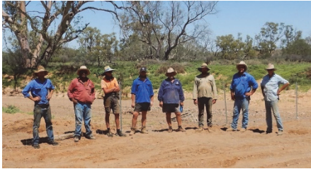
Local pastoralists fixing the flood damaged Dog Fence in 2022 near Marree in northern South Australia.