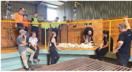
AWI-supported novice shearing and wool handling course at Cleve on the Eyre Peninsula of SA.