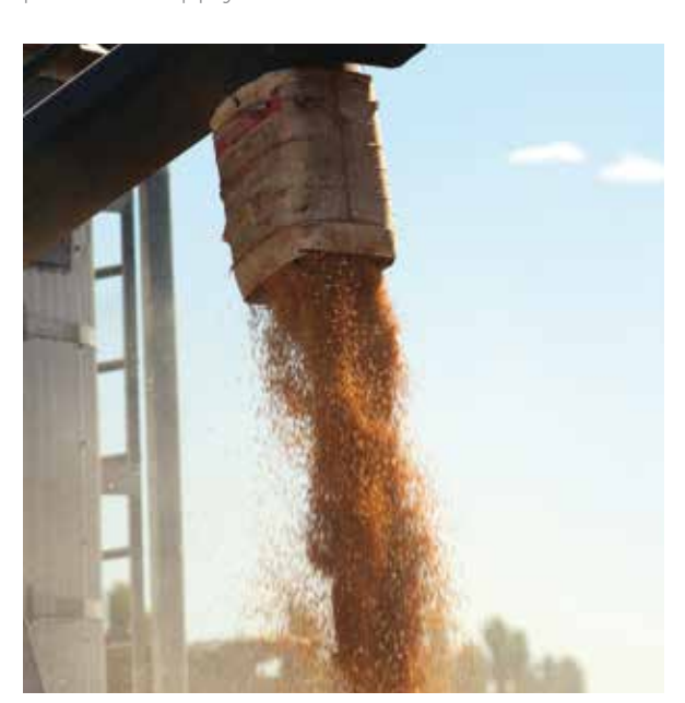
Fodder supply risk is an emerging issue for the wool industry

The 2002 drought saw sheep producers exposed to a shortage of grain and fodder for drought feeding of sheep. Prices for grain, fodder and alternative feedstuffs were extremely high and volatile. This document has been produced to assist sheep producers to better manage these price and supply risks in the future.