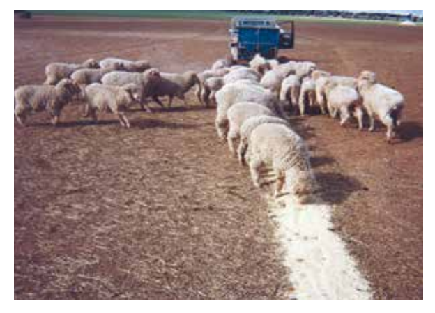
Destocking rather than feeding may be all or part of your drought fodder reserve strategy

Sheep producers who already have a cropping enterprise will generally have less difficulty in managing fodder reserves, as they are already trading in the grains market, dealing with storage issues and generally have more machinery to facilitate silage or hay production as well. Sheep producers with no cropping enterprise will need to consider machinery and management ability in particular when assessing their options.