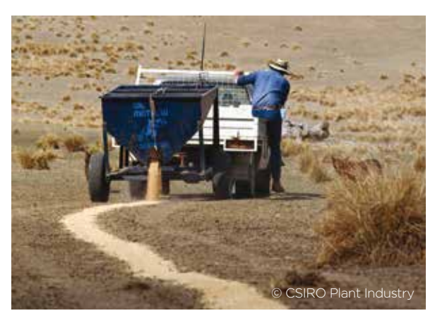
Silage is slower and more expensive to feed out compared to grain.

The most important action for all sheep producers is to determine the drought fodder reserve required and to take steps now to make provision for that amount. The actual system used should and will vary, with sheep producers deciding which system is most suitable for their enterprise.