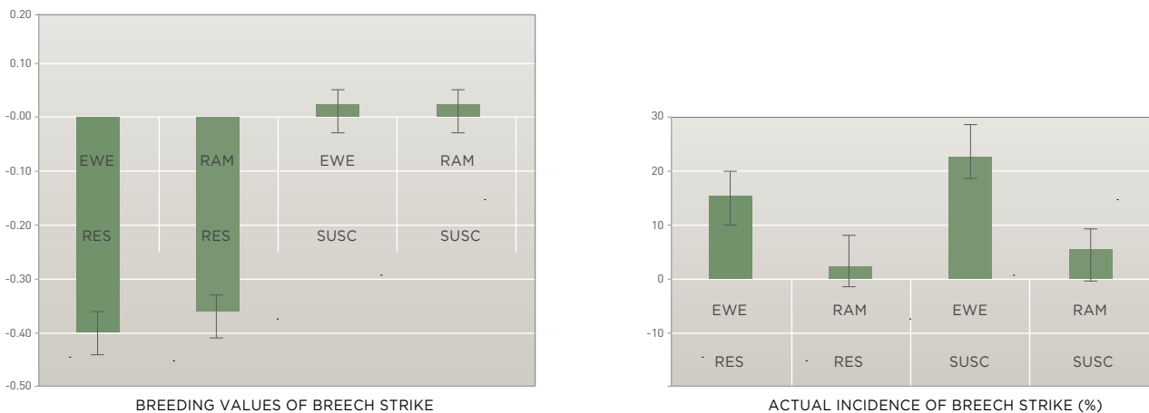
Figure 1. Average research breeding values (RBV) of breech strike and the actual mean incidence of breech strike for hogget ewes and rams of the resistant and control lines

Figure 1 shows the average Research Breeding Value (RBV) of breech strike of the 2011 born ram and ewe hoggets of the two lines that were crutched prior to the fly season, and the actual incidence of breech strike observed in these different groups. The difference in the RBV of breech strike between the resistant and control line was about 0.40 which is very similar to that between the mature ewes of the resistant and control lines mated in 2013 (Table 1). This relates to an actual difference between the two lines of 8% in hogget ewes (22% versus 14%) and 2% in hogget rams (4% versus 2%) where the overall incidence of breech strike of the flock was only 10%. Both these values indicate that the resistant line is on average 30% - 40% more resistant than the control line which agree with the difference in RBV of 0.40 that indicates the susceptible line has a higher likelihood to be struck.